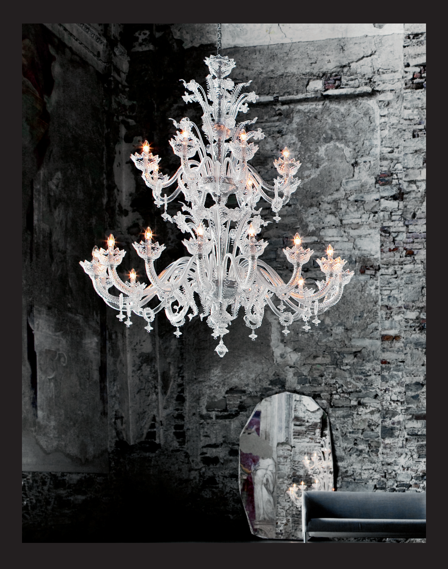
Home of the finest chandeliers in the world